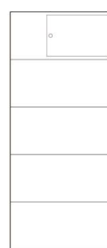
ST = 4 shelves and inner lockable compartment